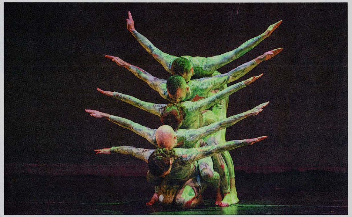
PUSH Physical Theatre and Rochester Philharmonic Orchestra will perform collaborative new works this week.