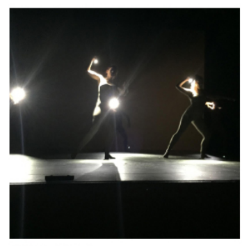
PUSH Physical Theatre

Rochester's PUSH Physical Theatre has established itself as one of the foundation acts of the KeyBank Rochester Fringe Festival. It is essential viewing each year: What amazing stories will it tell, through the simple act of moving one's body?